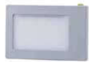
Dental film viewer