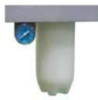
Distilled water tank