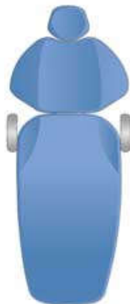
Sky blue (SD800)